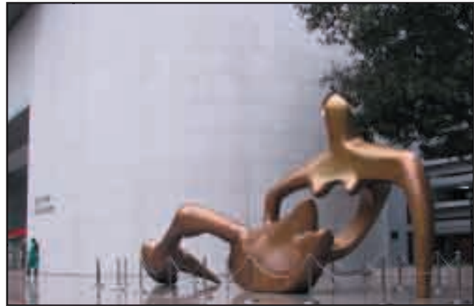
TOP & MIDDLE: MURAL (1973) BY EDUARDO CASTRILLO, EXTERIOR AND INTERIOR VIEWS BELOW: RECLINING FIGURE (1938) BY HENRY MOORE; THE WORK WAS PLACED HERE IN 1983.