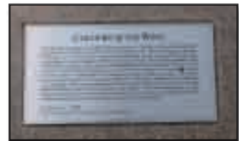
A SAMPLING OF LABELS, FROM TOP: JOYOUS RIVERS (1987) BY ELSIE TAN; ENDLESS FLOW (1980) BY TAN TENG KEE, BUT PLACED IN THIS POSITION AND LABELLED IN 1983; DANCER (1990) BY SUN YULI; COLOURS OF THE WIND (2002) BY ELSIE TAN.