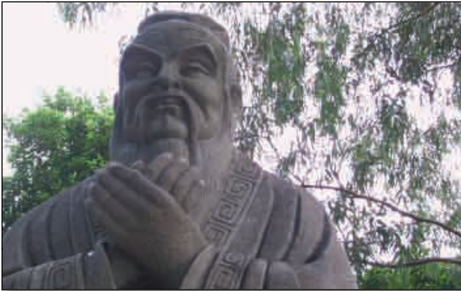
CHINESE LEGENDARY HEROES SCULPTURE GARDEN (1991): CONFUCIUS (DETAIL)