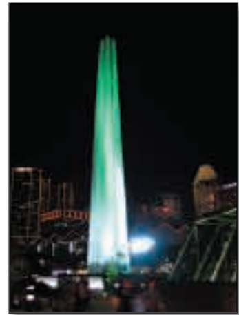
WAR MEMORIAL (1967), DESIGN BY SWAN & MCLAREN

The monument’s design is by the architectural firm of Swan & McLaren, and I believe it is a rather effective one. It adheres scrupulously to the particular conception of the public that had come out of the political struggle of the previous decade – built upon the concern for justice and fair treatment of Singapore’s diverse communities. The Chinese community’s initial sponsorship of the monument, (and any perception of differential suffering during the war), is screened out. Singapore’s four official languages each receive equal treatment in a matter of this seriousness, the four pillars of the monument standing together. The small and intimate inner area of the monument creates a strong spatial experience, and effectively communicates the private grief