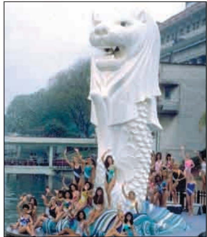
JU MING'S LIVING WORLD (1987), IN FRONT OF THE SINGAPORE HISTORY MUSEUM, BELOW: THE MERLION (1972)