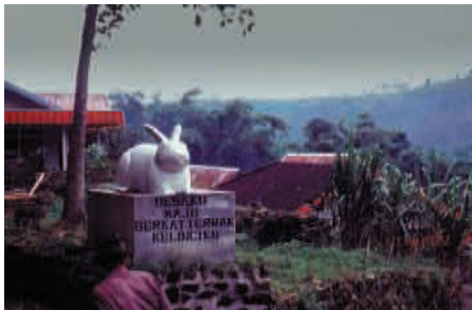
VILLAGE NEAR SARANGAN, EAST JAVA, 1989

IN 1989 I VISITED A VILLAGE ON THE SLOPES OF MT LAWU, near Sarangan, just over the border in East Java from the province of Central Java. In the town square was a large, squat statue of a rabbit, made in concrete, and adorned with the slogan that “our village has developed thanks to rabbits”. The village had evidently won the provincial rabbit-breeding contest, and as a reward, received a cash grant, a metalled road, some television sets and other assorted fruit of development. Curious, we made further enquiries, but were told eventually that the rabbits themselves were not receiving visitors. In fact, after further questioning, it transpired that there were no rabbits in the village at all. The contest-winners had been rented for the occasion, from towns across the border. After playing their part, they had been returned to their real owners. The concrete rabbit is the only one left.