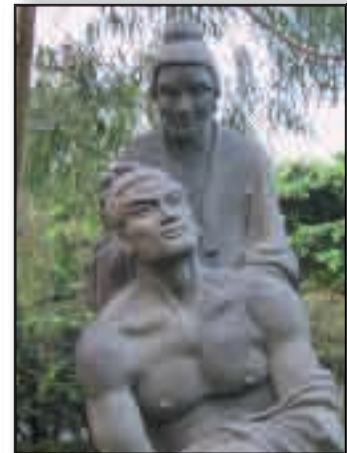
CHINESE LEGENDARY HEROES SCULPTURE GARDEN (1991): TOP: HUA MULAN MIDDLE: ZHENG HE BOTTOM: YUE FAI