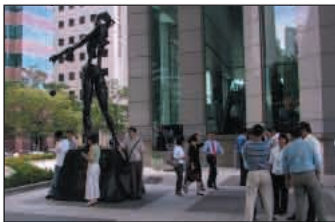
HOMAGE TO NEWTON BY SALVADOR DALI (1985).

I should point out that this desire to turn abstraction to a more easily comprehended statement of certain values is not solely a Singaporean phenomenon. In 1986 George Rickey's Triple L, Excentric Gyrotory, Gyrotory II was renamed by its purchasers (perhaps understandably!), as Leadership , as it was placed in front of the postmodern façade of the reception building of the headquarters of the CocaCola Corporation in Atlanta, Georgia, USA. An accompanying color brochure makes all the connections: