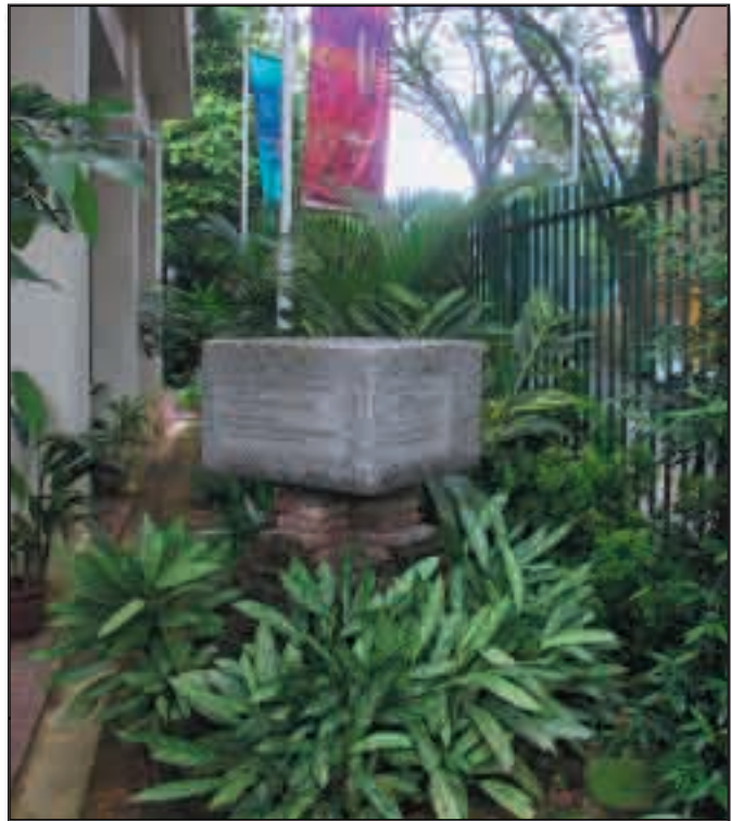
FOUNDATION STONE OF THE MONUMENT TO THE EARLY FOUNDERS OF SINGAPORE (1970). THE MEMORIAL HAS BEEN MOVED TO THE OFFICES OF THE NATIONAL ARCHIVES OF SINGAPORE.

The Merlion (1972) was commissioned by the Tourism Board in service of economic development, because “it was felt that Singapore needed a distinctive symbol with which it can be identified.” 13 Raffles